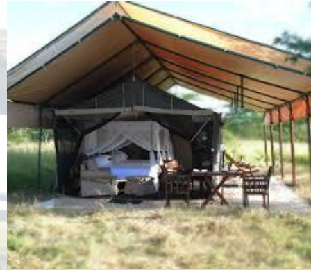
Tanzania Bush camp