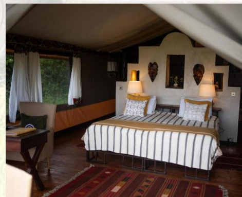
Kilima Camp Bed view

OLANKA SAFARIS LIMITED.TOURS &TRAVEL COMPANY, GRALEX PLAZA, WEST ROAD, NAKURU