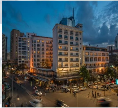
Sarova Stanley Hotel (Exterior)