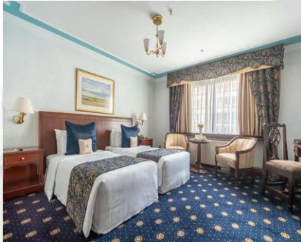
Sarova Stanley room