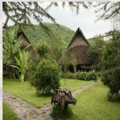
Flamingo Hill Tented Camp