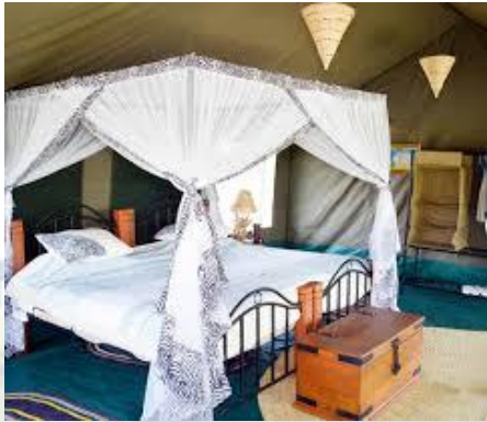
Tanzania Bush camp Room