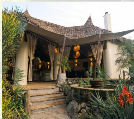
Kilima Camp Room