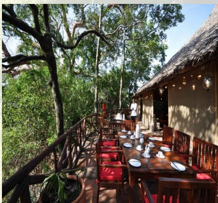
Mara Figtree Table Setup