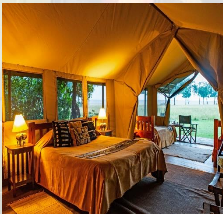
Flamingo Hill Tented Room