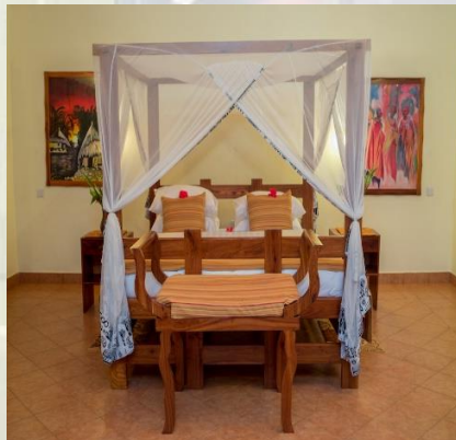
Kudu Lodge Bedroom