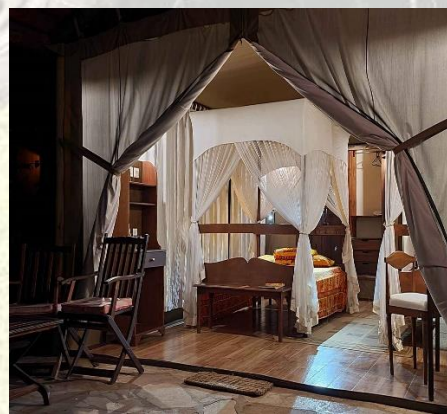
Mara Figtree Bedroom

OLANKA SAFARIS LIMITED. TOURS & TRAVEL COMPANY, GRALEX PLAZA, WEST ROAD, NAKURU